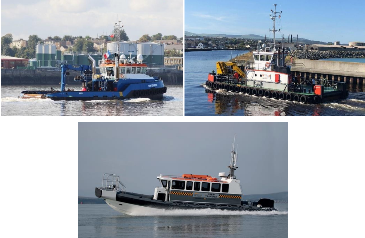
Top left TSM Kermor , Top right CT Vector , bottom CRC Vanguard

Crew will be transferred onto the JUBs by a 12m white-hulled, crew-transfer vessel called CRC Vanguard .