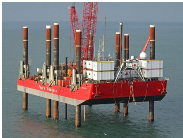
Jack-up Barge Excalibur

The works comprise Geotechnical Investigations (GI) of the Sizewell offshore area to facilitate construction of intake and outfall tunnels, and associated seabed constructions, for the power plant cooling system. A 60m x 32m jack-up barge called Excalibur will be employed to undertake the works. Works on the offshore are expected to start on 29 th August 2024 for period of 16 weeks, dependent on weather.