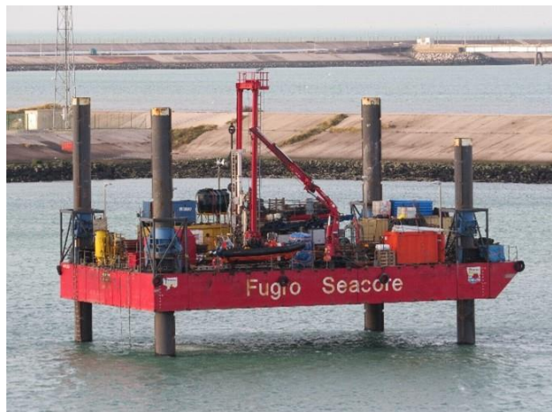
Jack-up Barge Aran 250

The works comprise Geotechnical Investigations (GI) of the Sizewell nearshore area to facilitate construction of the SZC beach landing facility, piled jetty, combined discharge outfall and de-salination plant tunnels. A 27m x 17m jack-up barge (JUB) called Aran 250 will be employed to undertake the drilling and sampling operations. Works on the nearshore are expected to start on 29 th August 2024 for period of 10-14 days, dependent on weather.